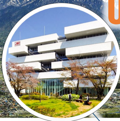
JRC Advanced Technology Center FY2016 grant project

(Amount after multiplying the set grant rate by the equipment investment)