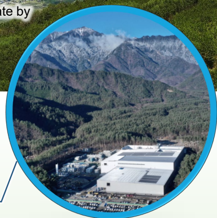
Suntory Natural Water Northern Japan Alps Shinano-no-Mori Water Plant FY2019 grant-approved project